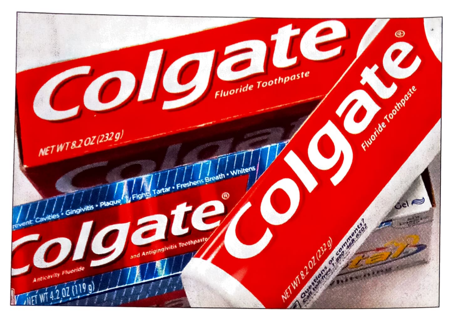
The product mix: Colgate-Palmolive's nicely consistent product mix contains dozens of brands that constitute the "Colgate World of Care"products that "every day, people like you trust to care for themselves and the ones they love."